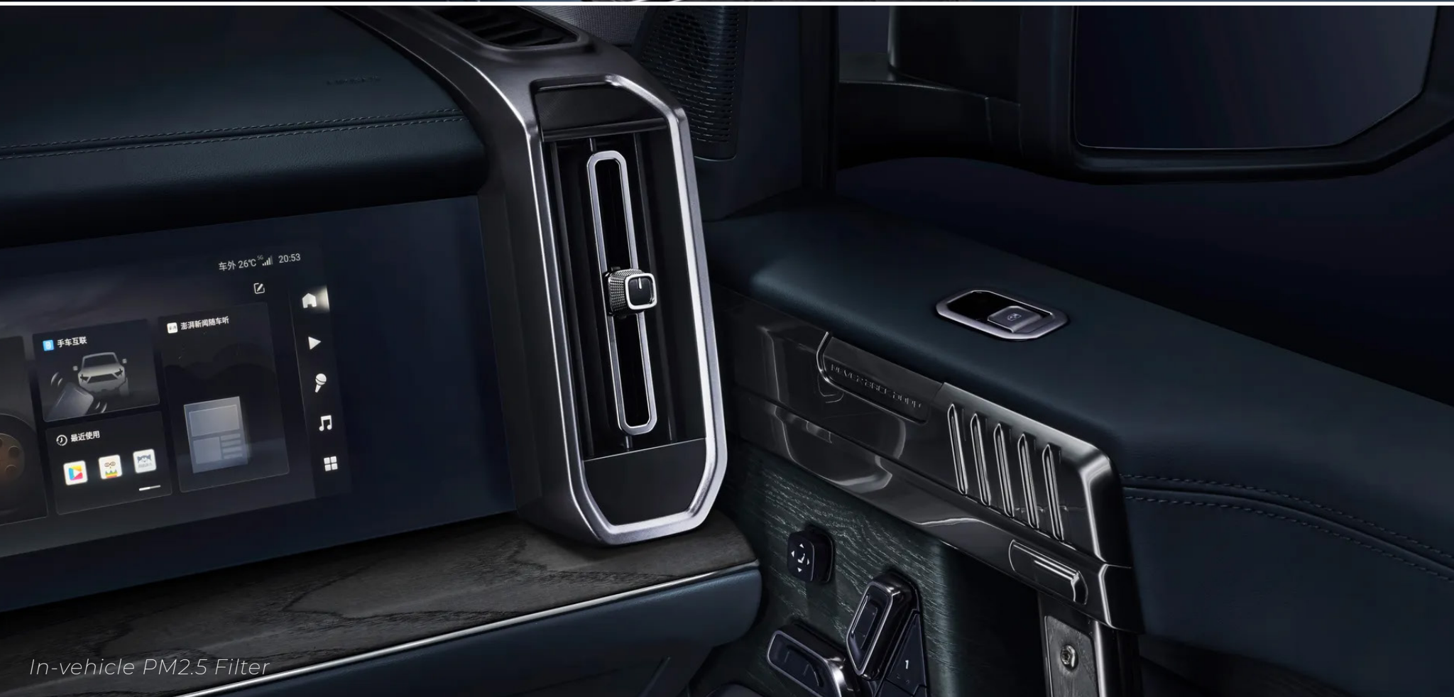
In-vehicle PM2.5 Filter