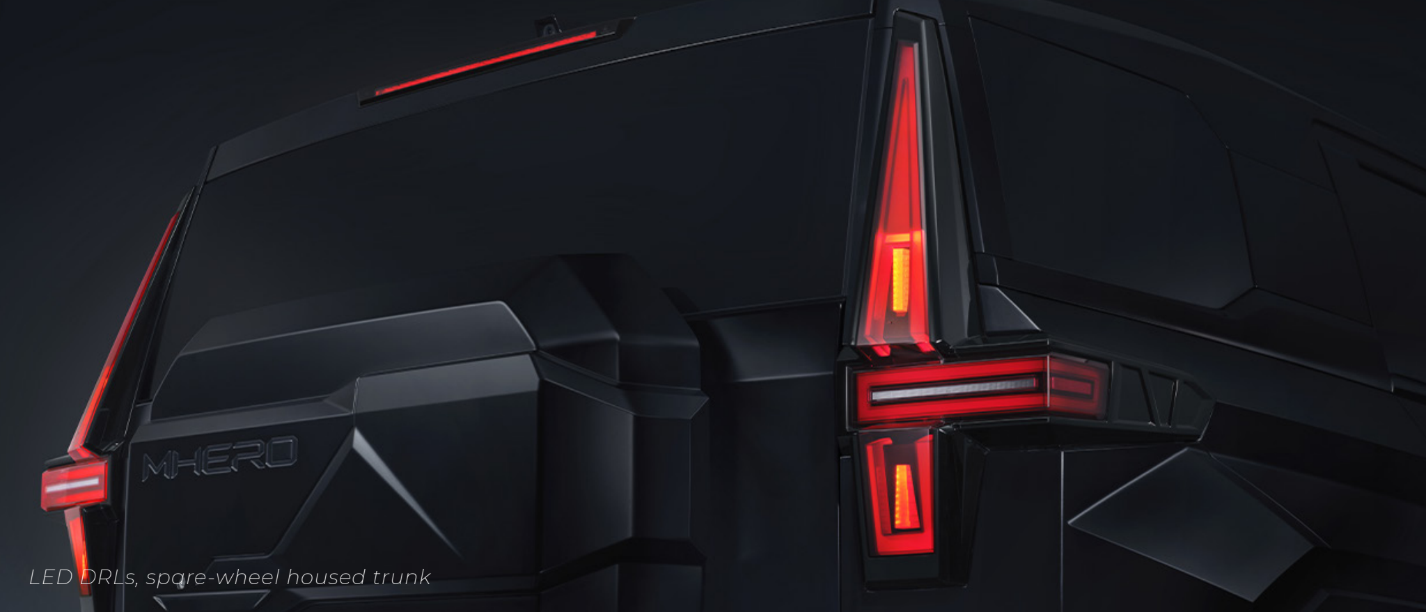
LED DRLs, spare-wheel housed trunk