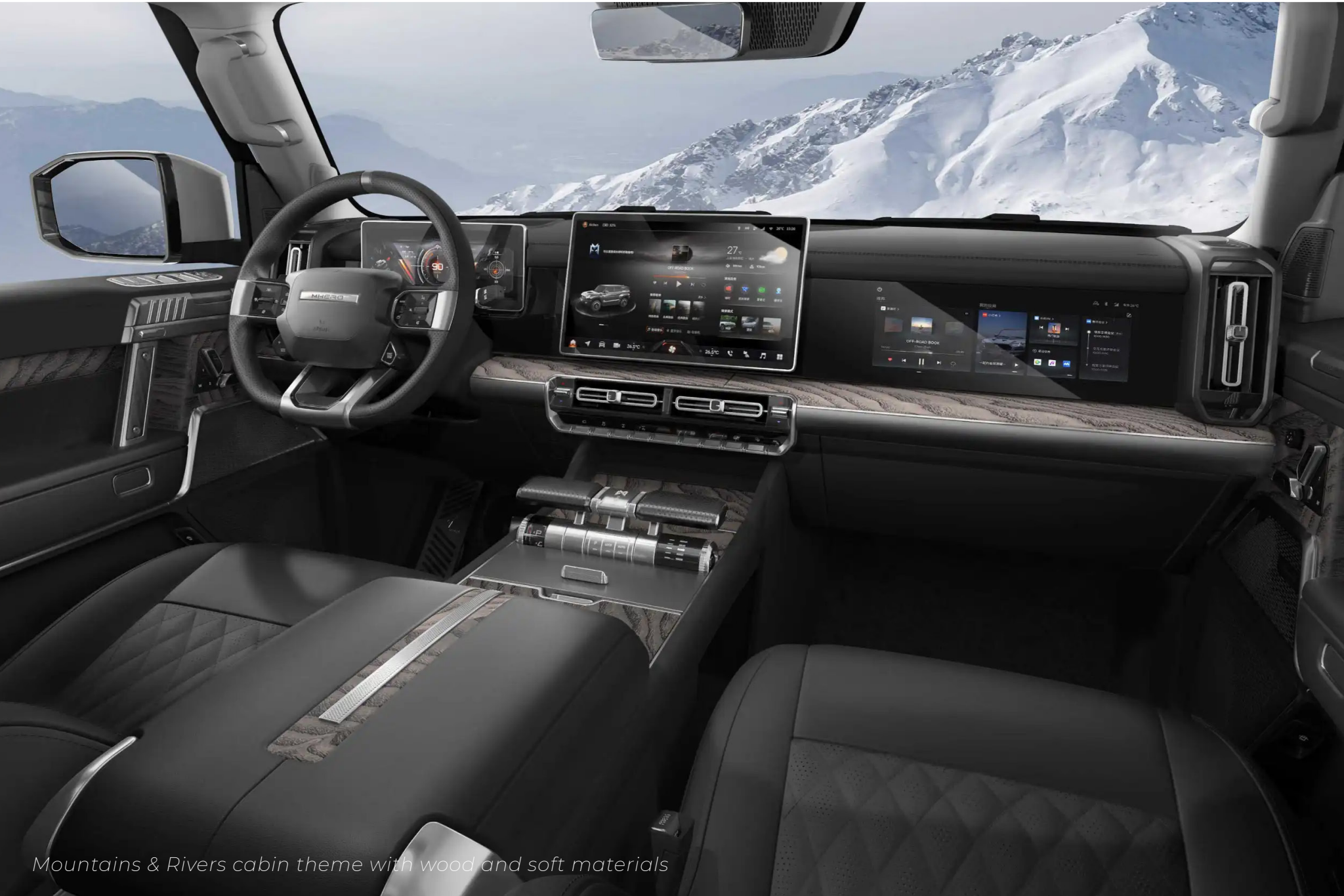
Mountains & Rivers cabin theme with wood and soft materials