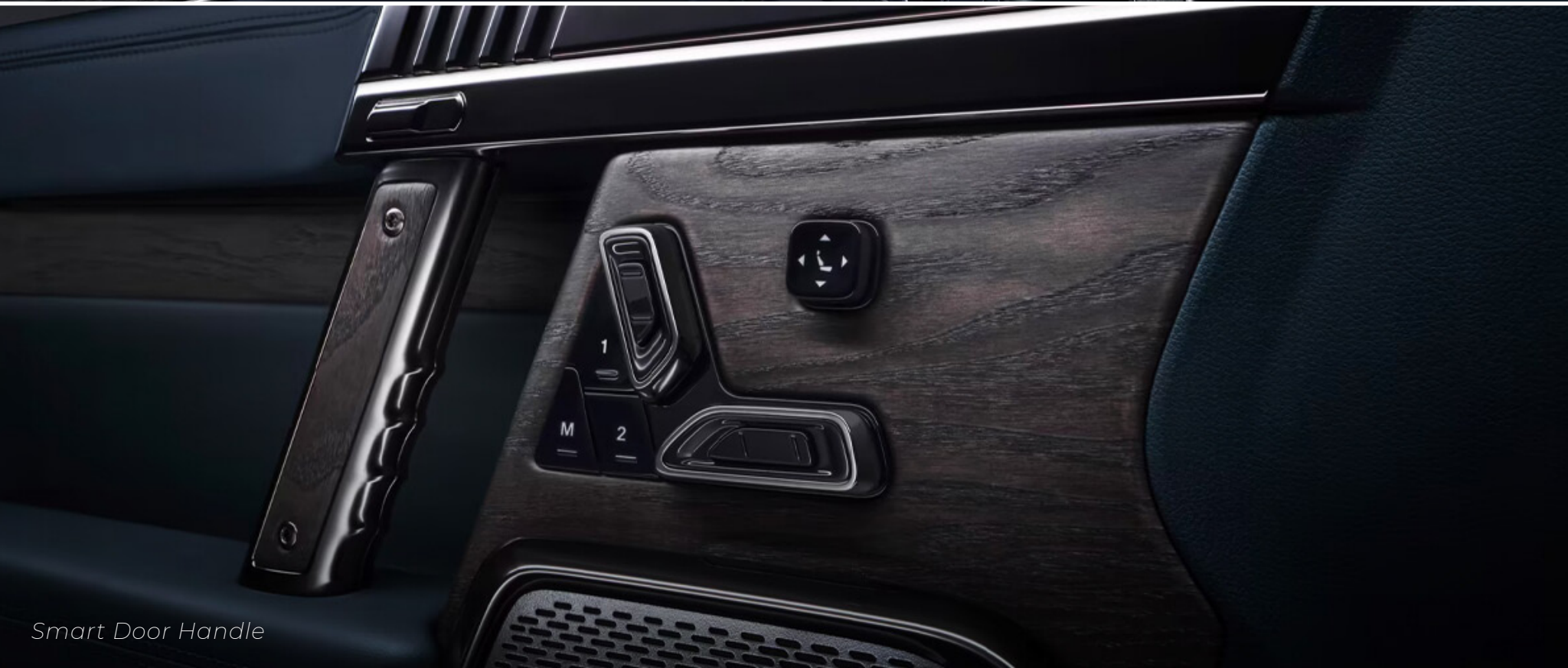
Smart Door Handle