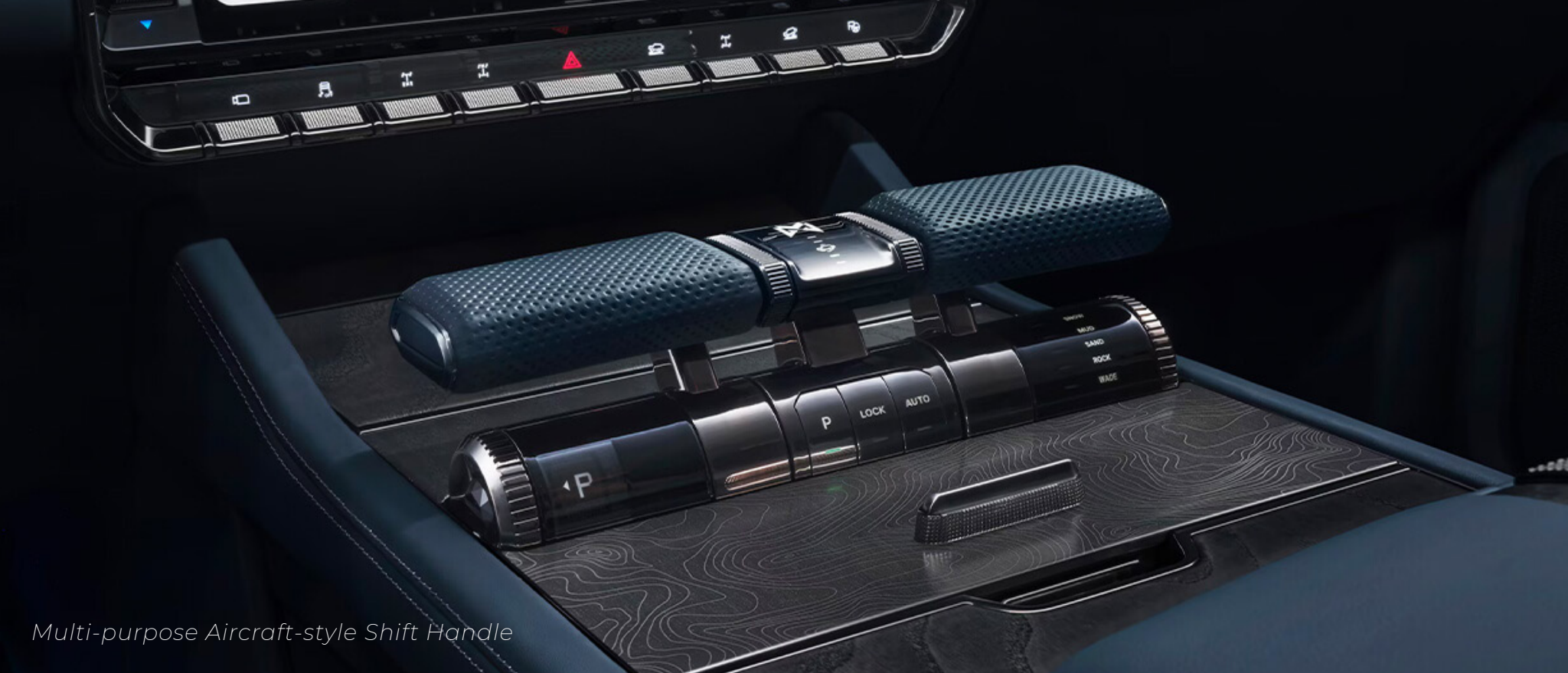
Multi-purpose Aircraft-style Shift Handle