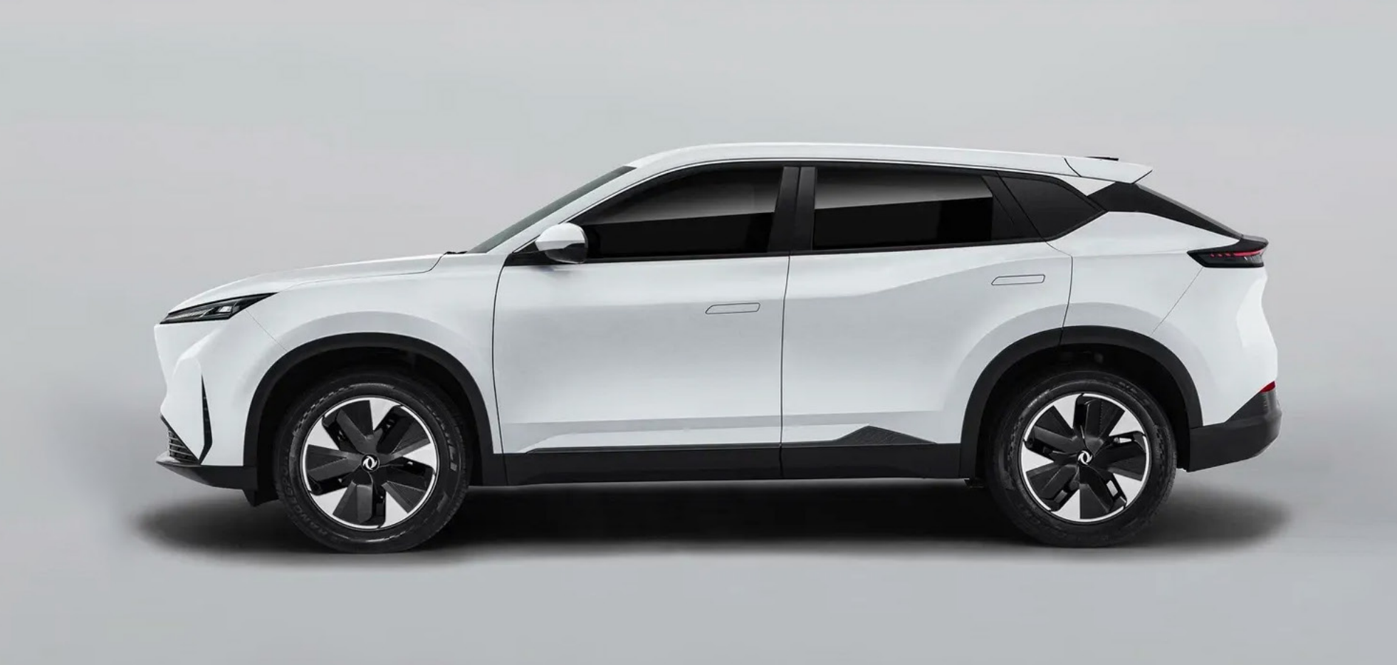
Hidden door handles