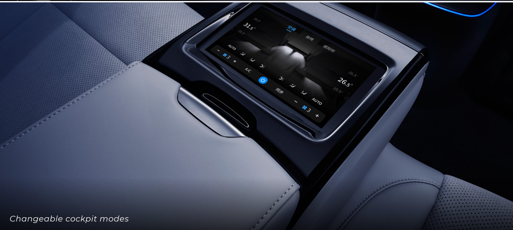
Changeable cockpit modes