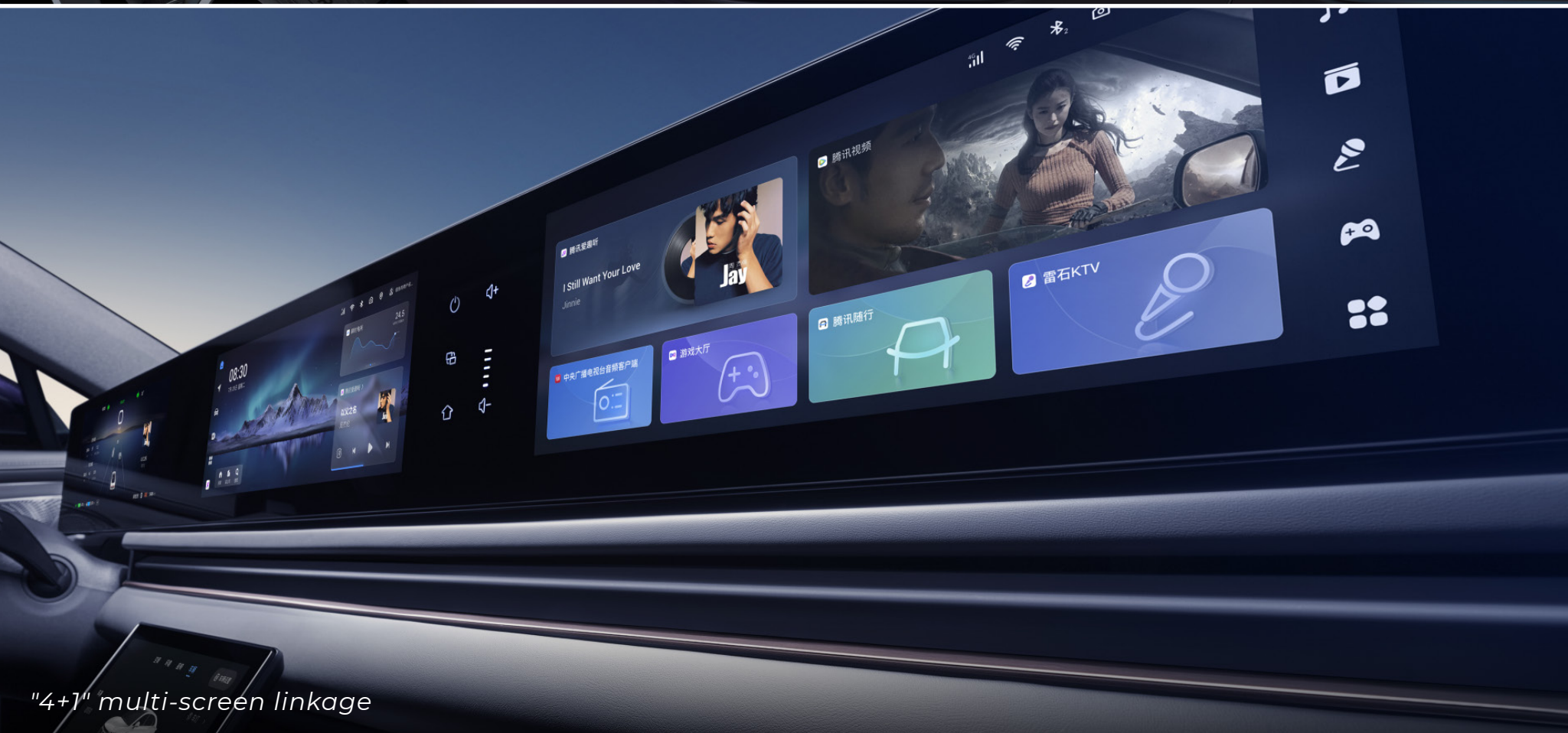
"4+1" multi-screen linkage