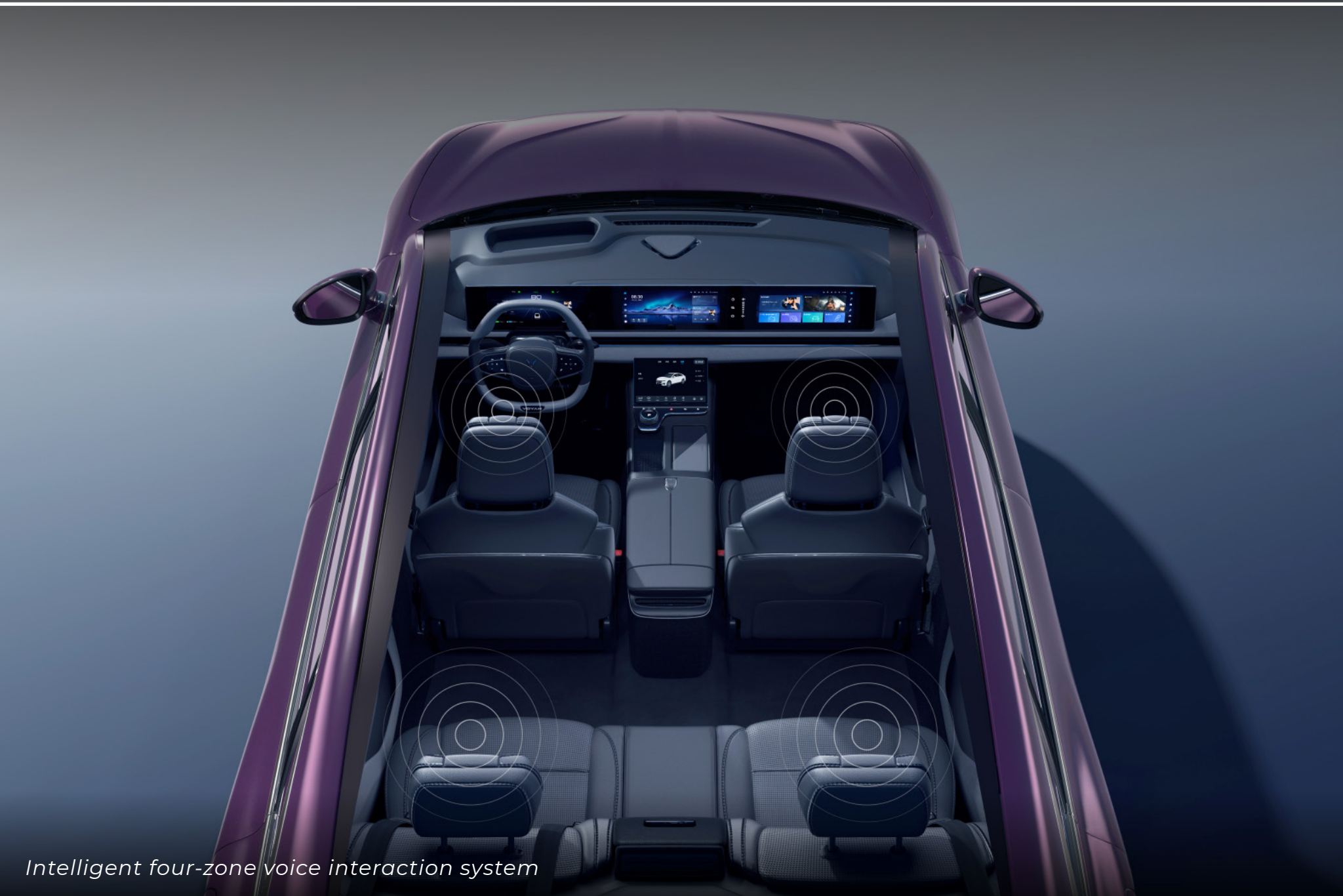
Intelligent four-zone voice interaction system