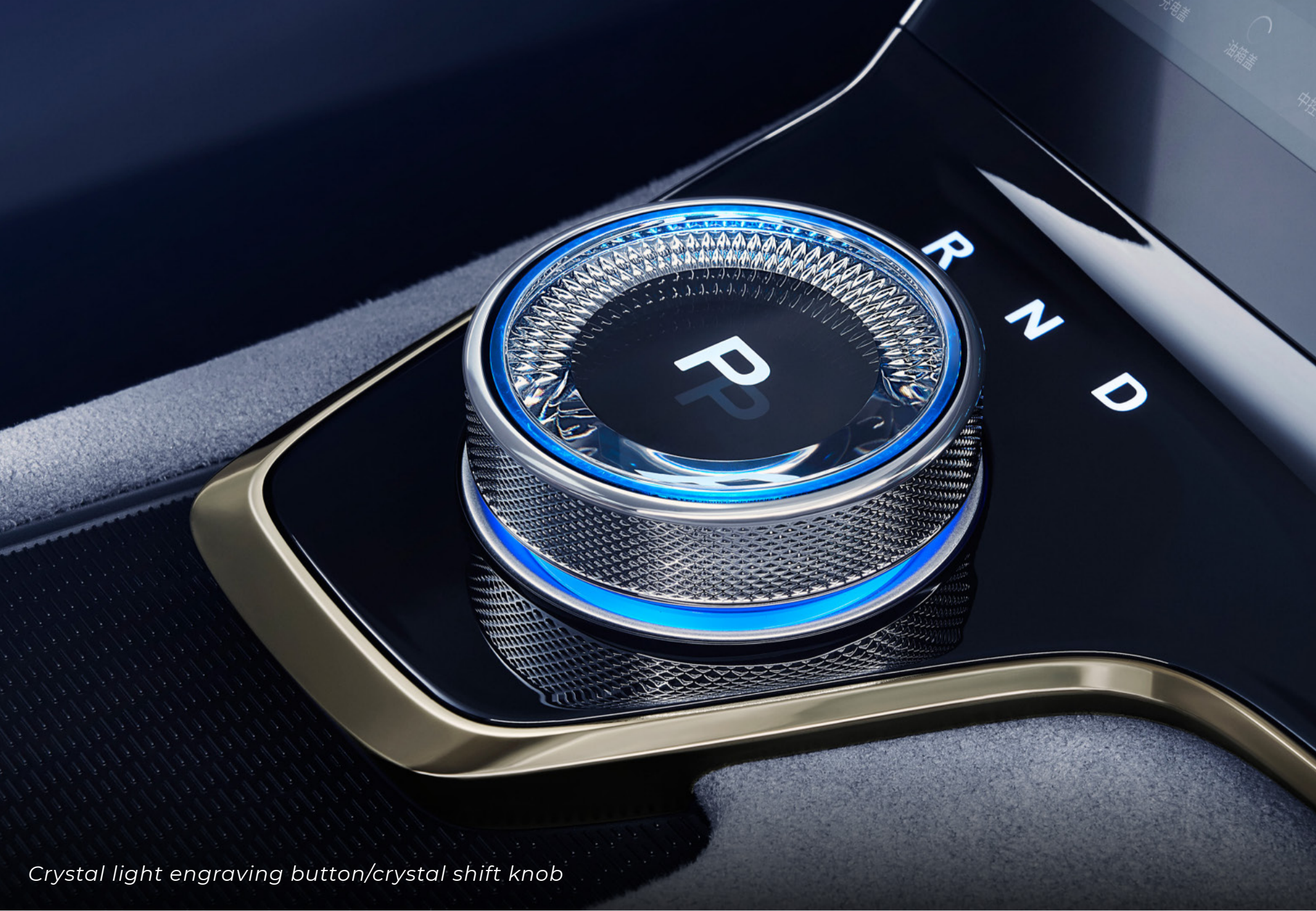
Crystal light engraving button/crystal shift knob