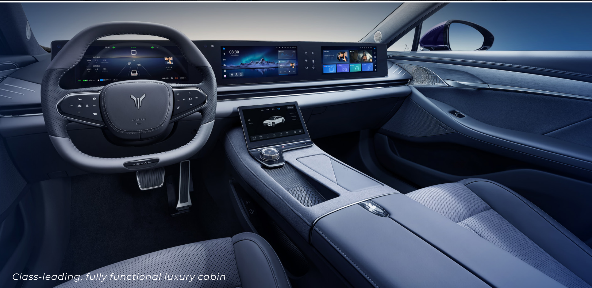
Class-leading, fully functional luxury cabin