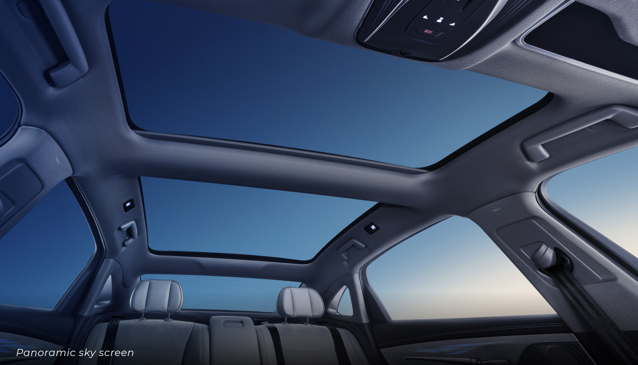
Panoramic sky screen