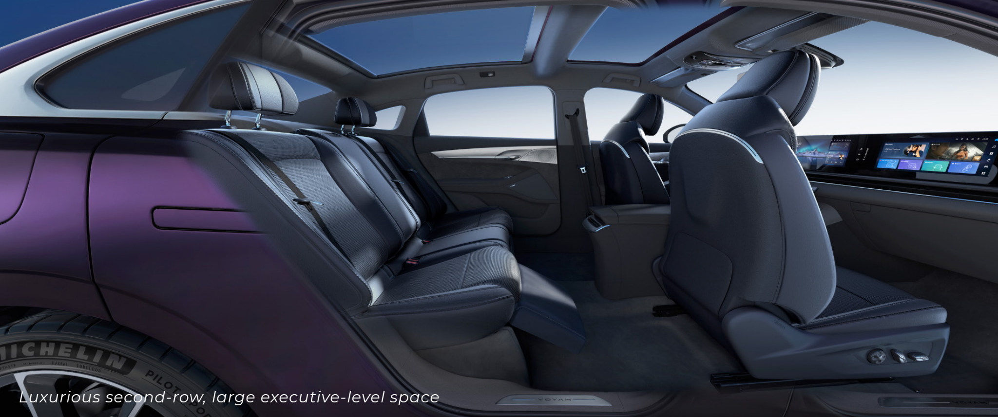
Luxurious second-row, large executive-level space