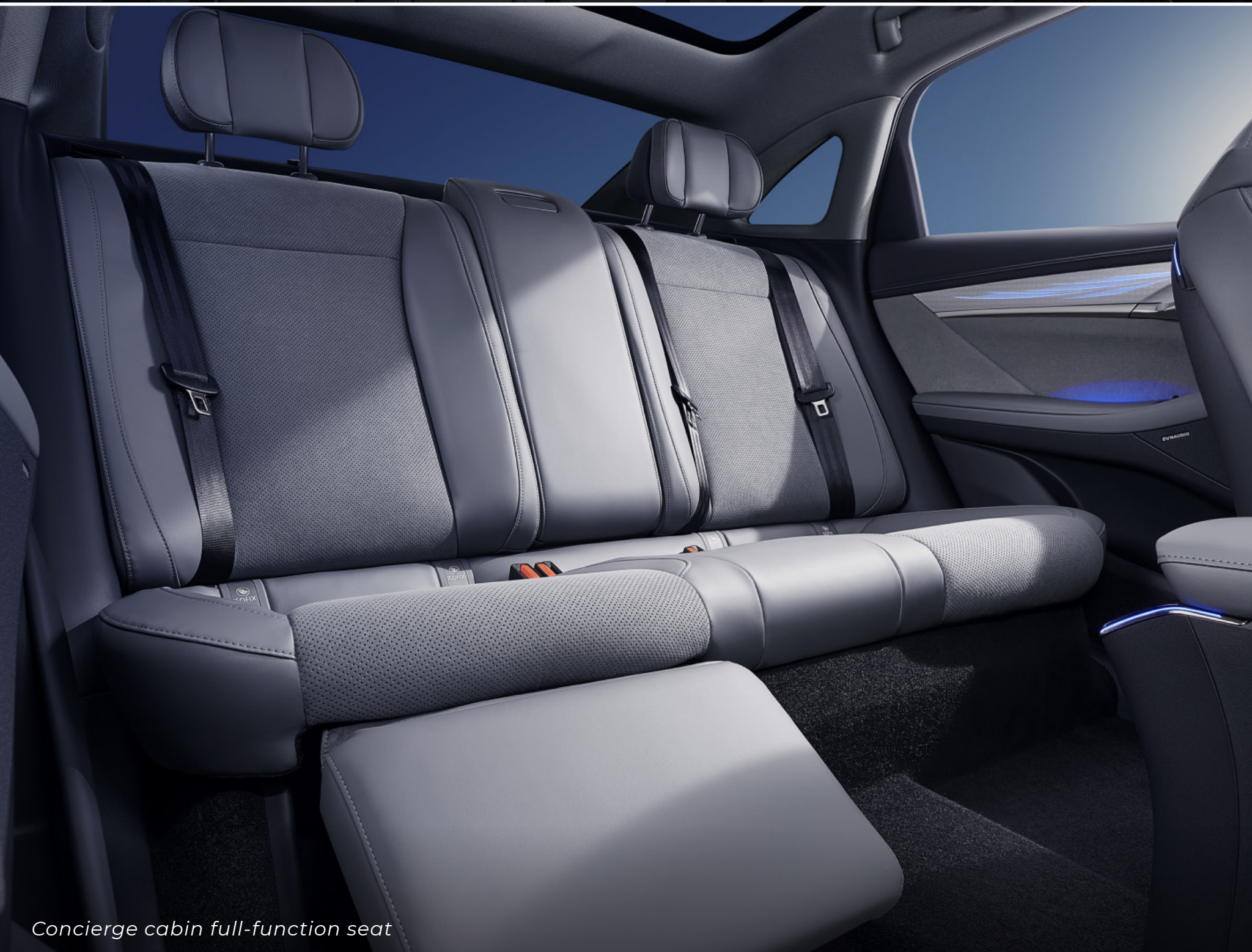
Concierge cabin full-function seat