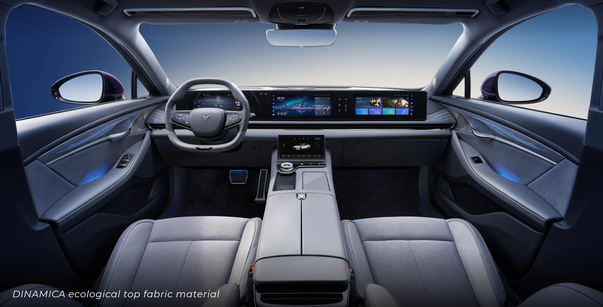
DINAMICA ecological top fabric material