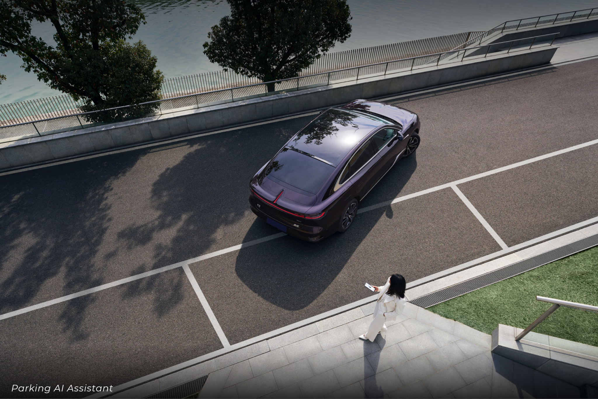
Parking AI Assistant