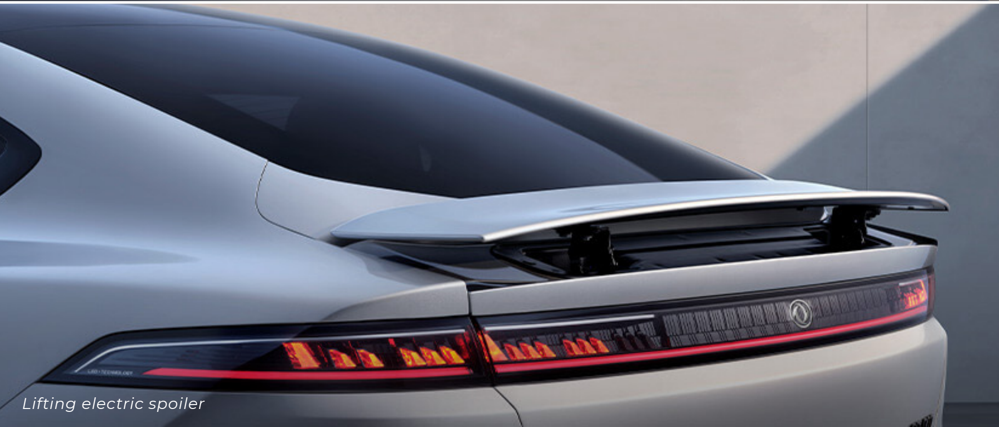
Lifting electric spoiler