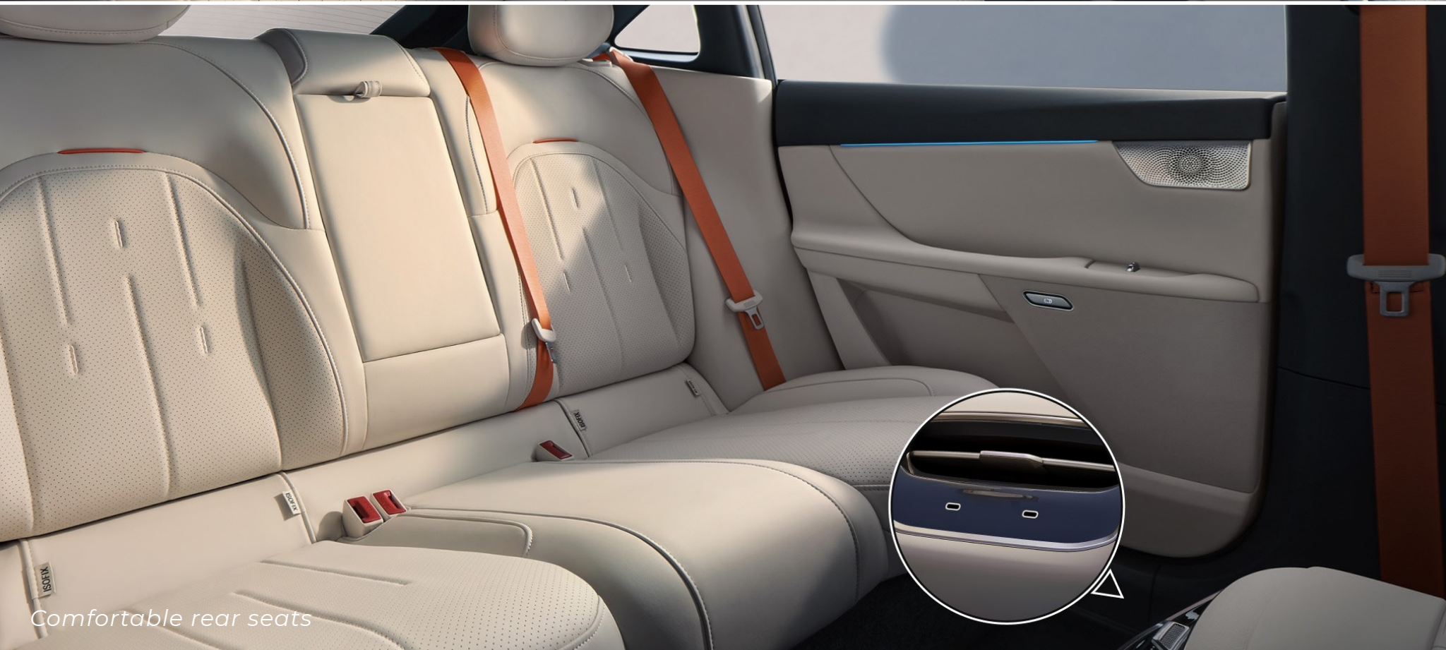
Comfortable rear seats