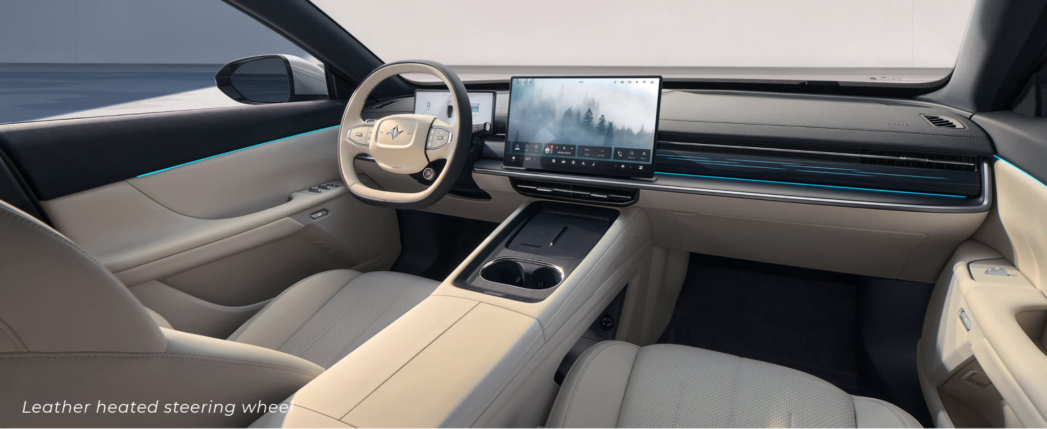
Leather heated steering wheel