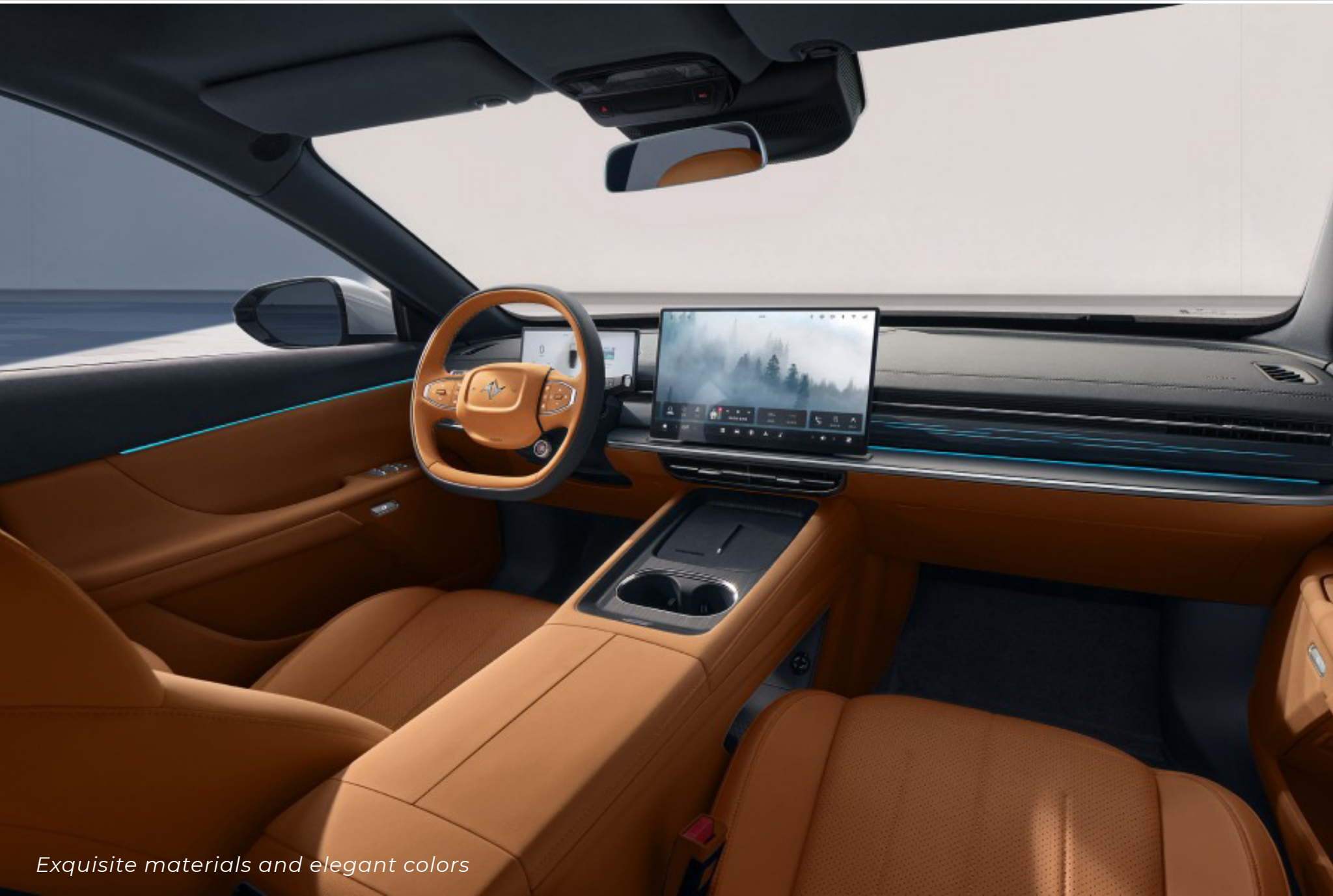
Exquisite materials and elegant colors