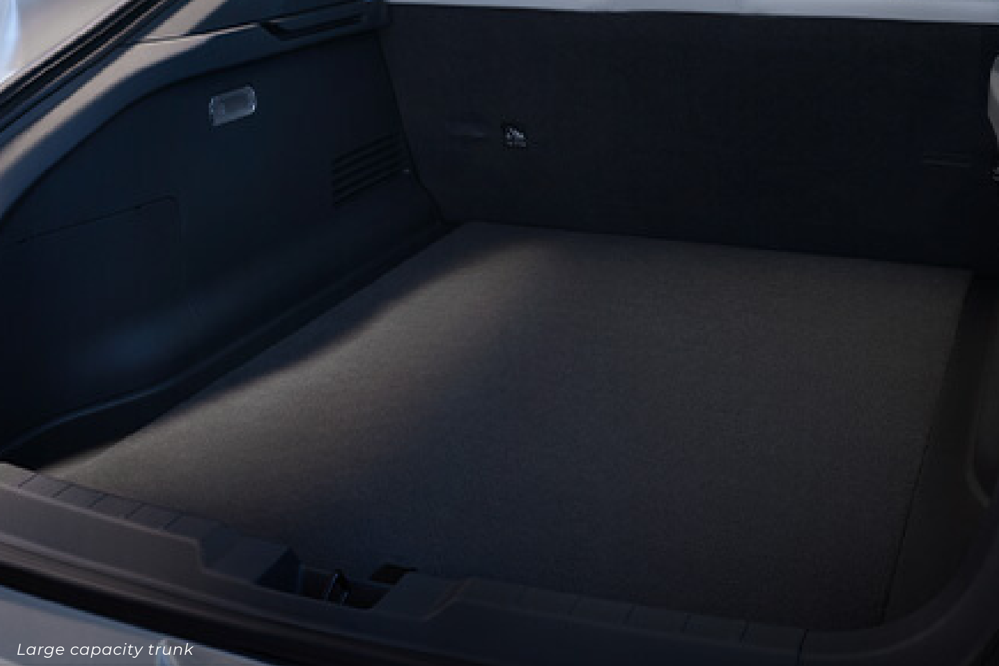
Large capacity trunk