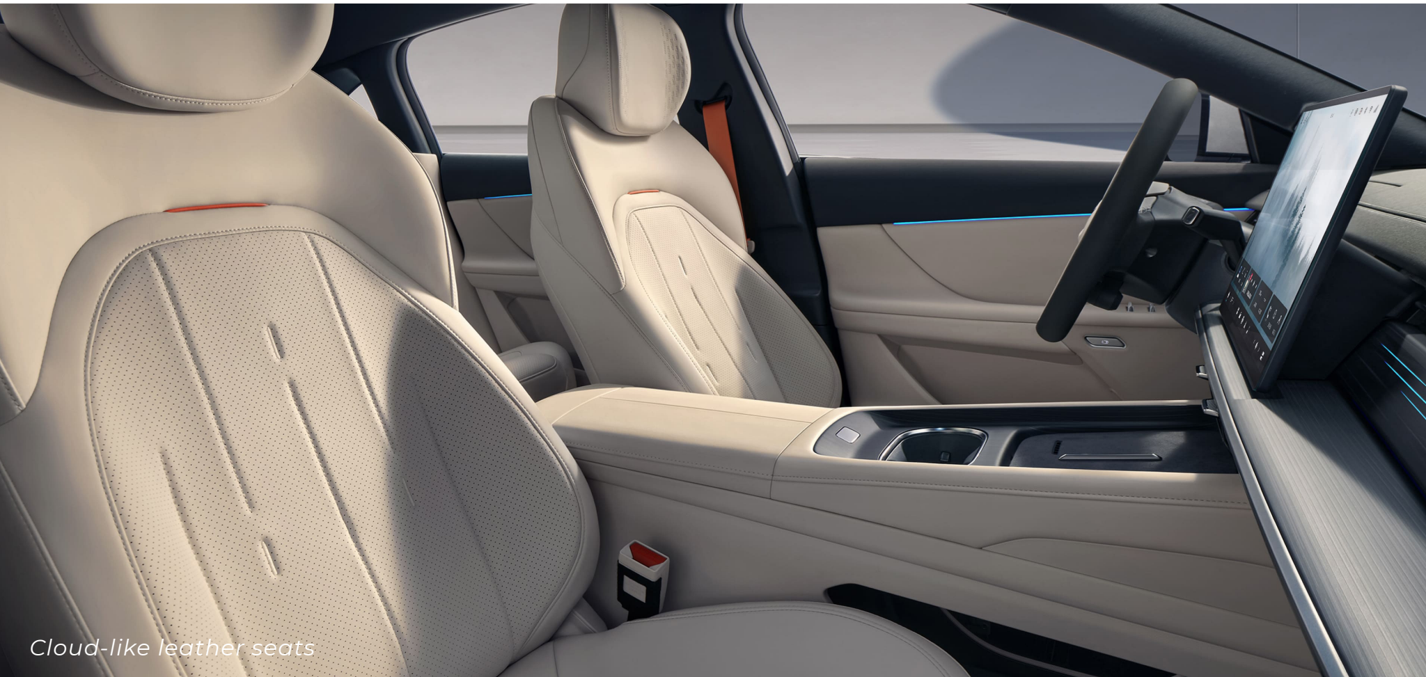
Cloud-like leather seats