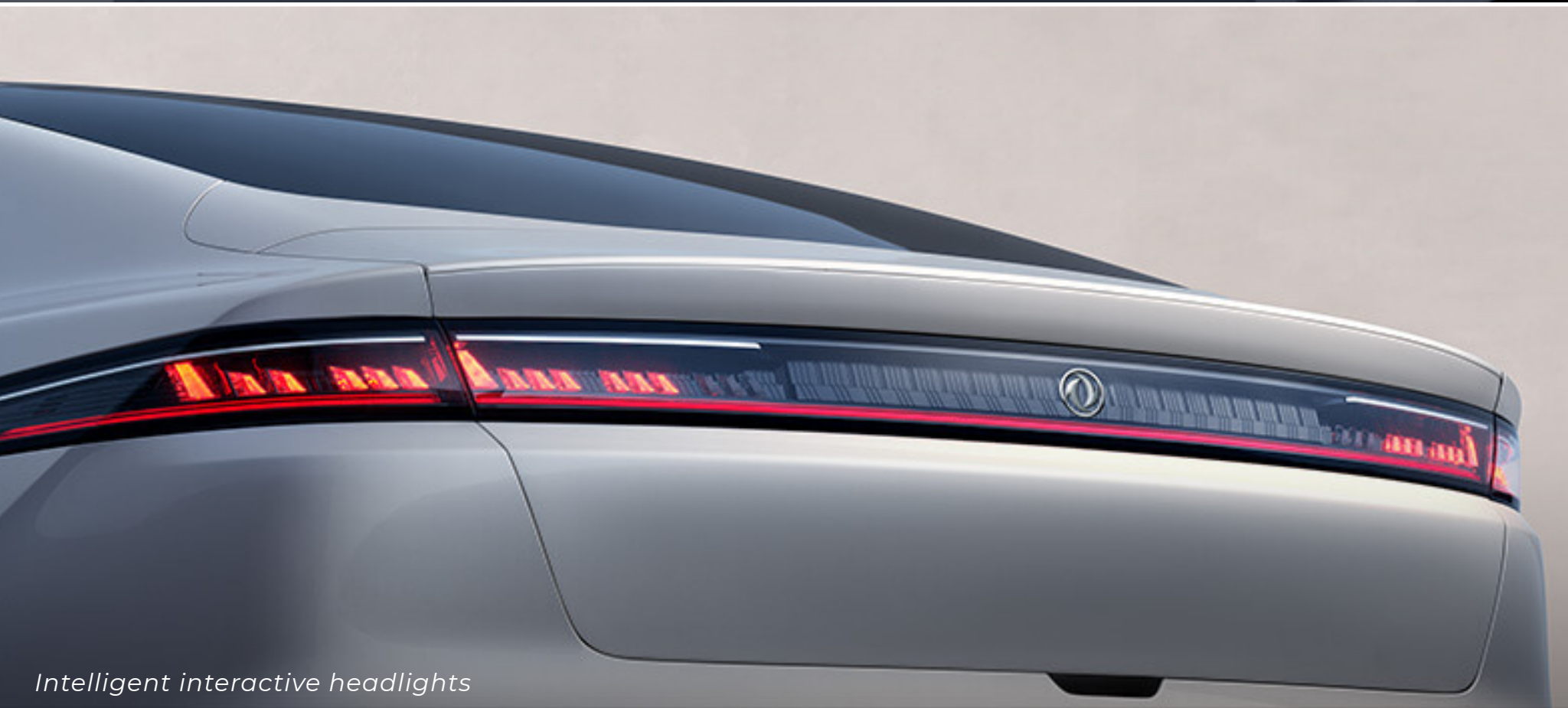
Intelligent interactive headlights