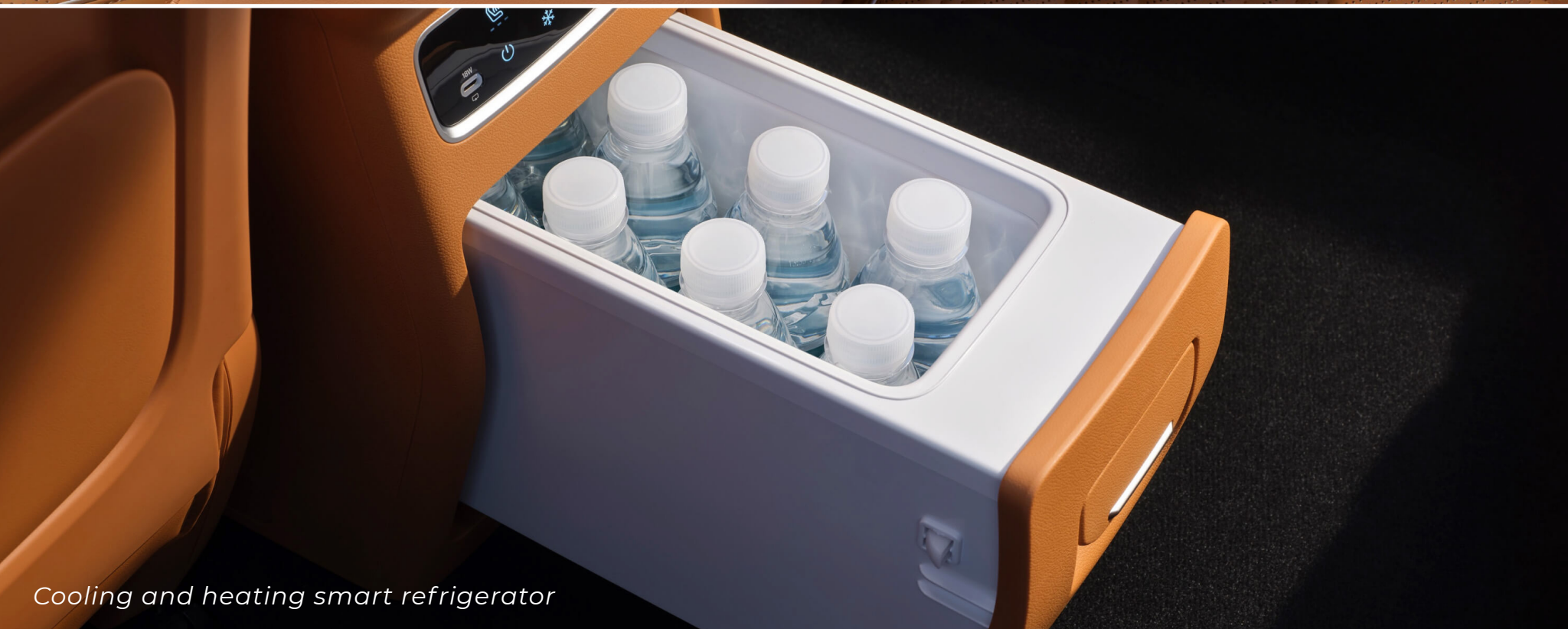
Cooling and heating smart refrigerator