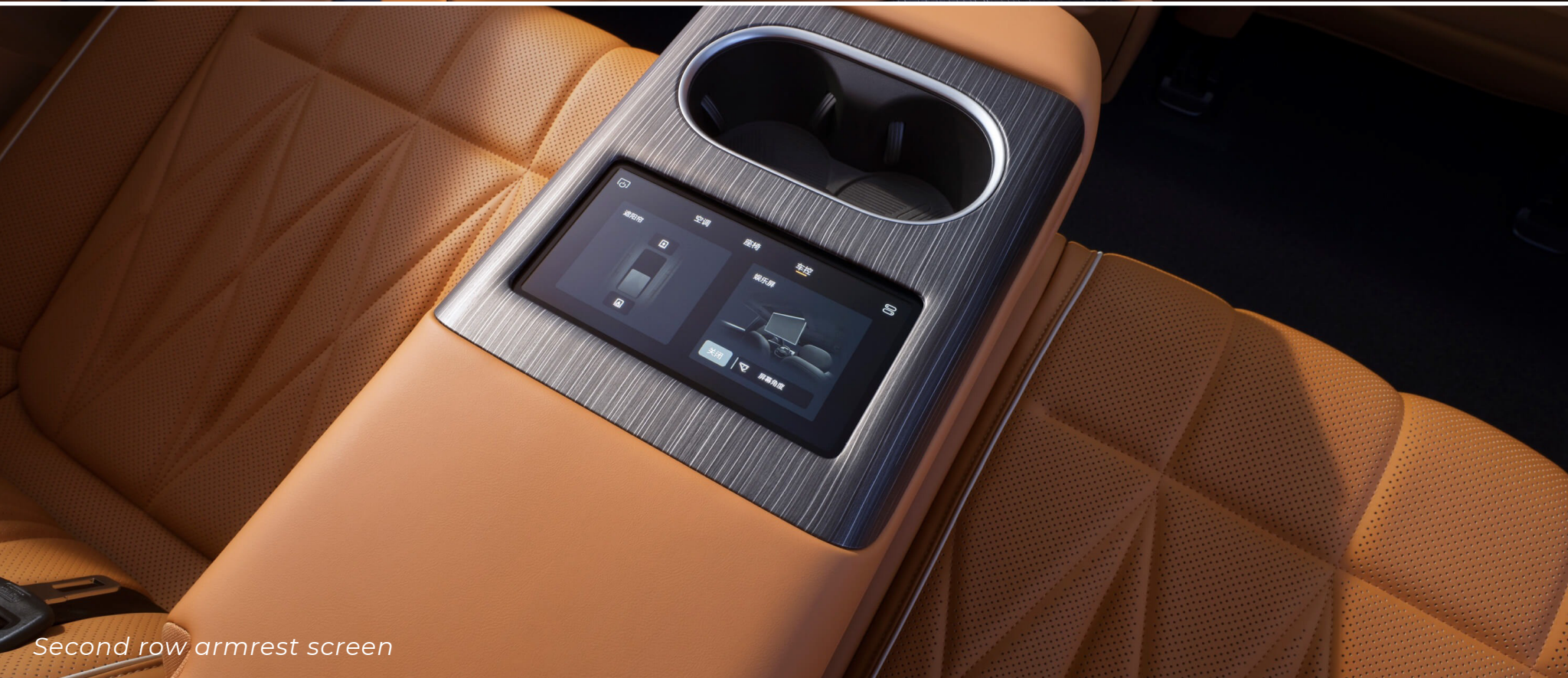
Second row armrest screen