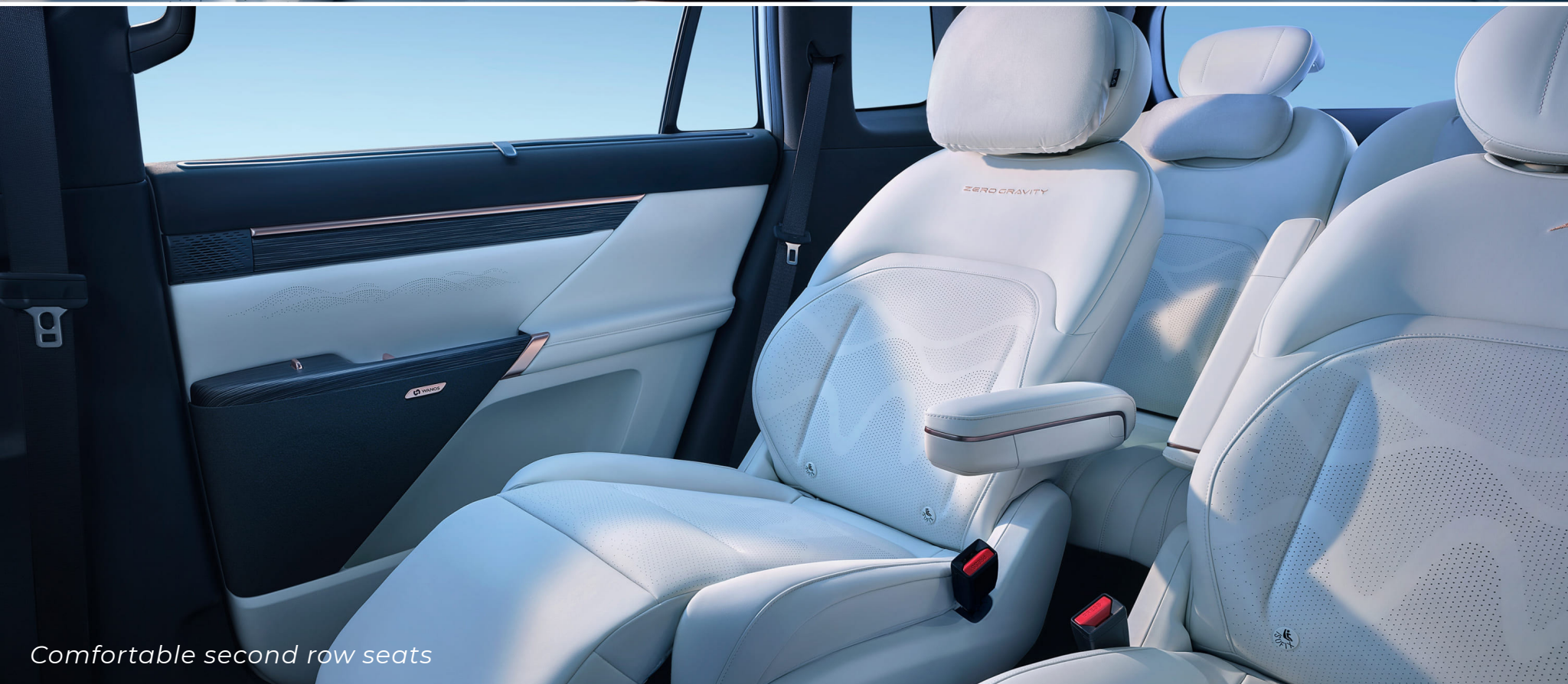
Comfortable second row seats