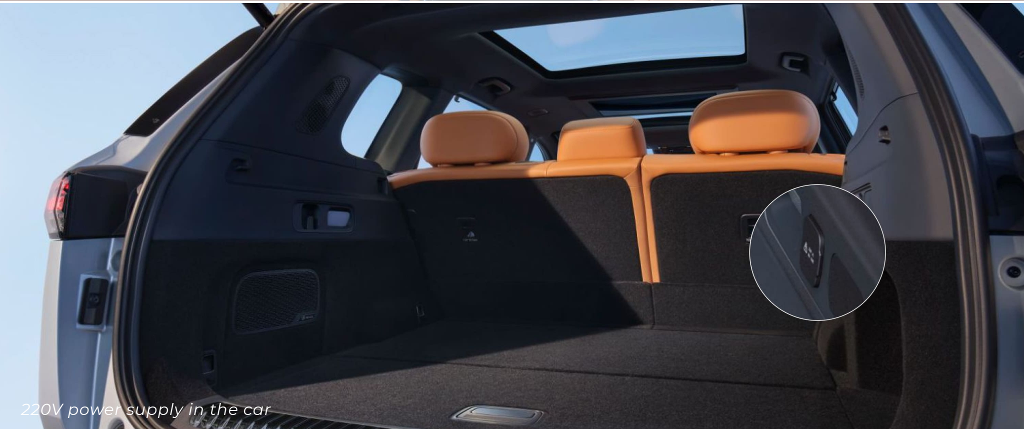
220V power supply in the car