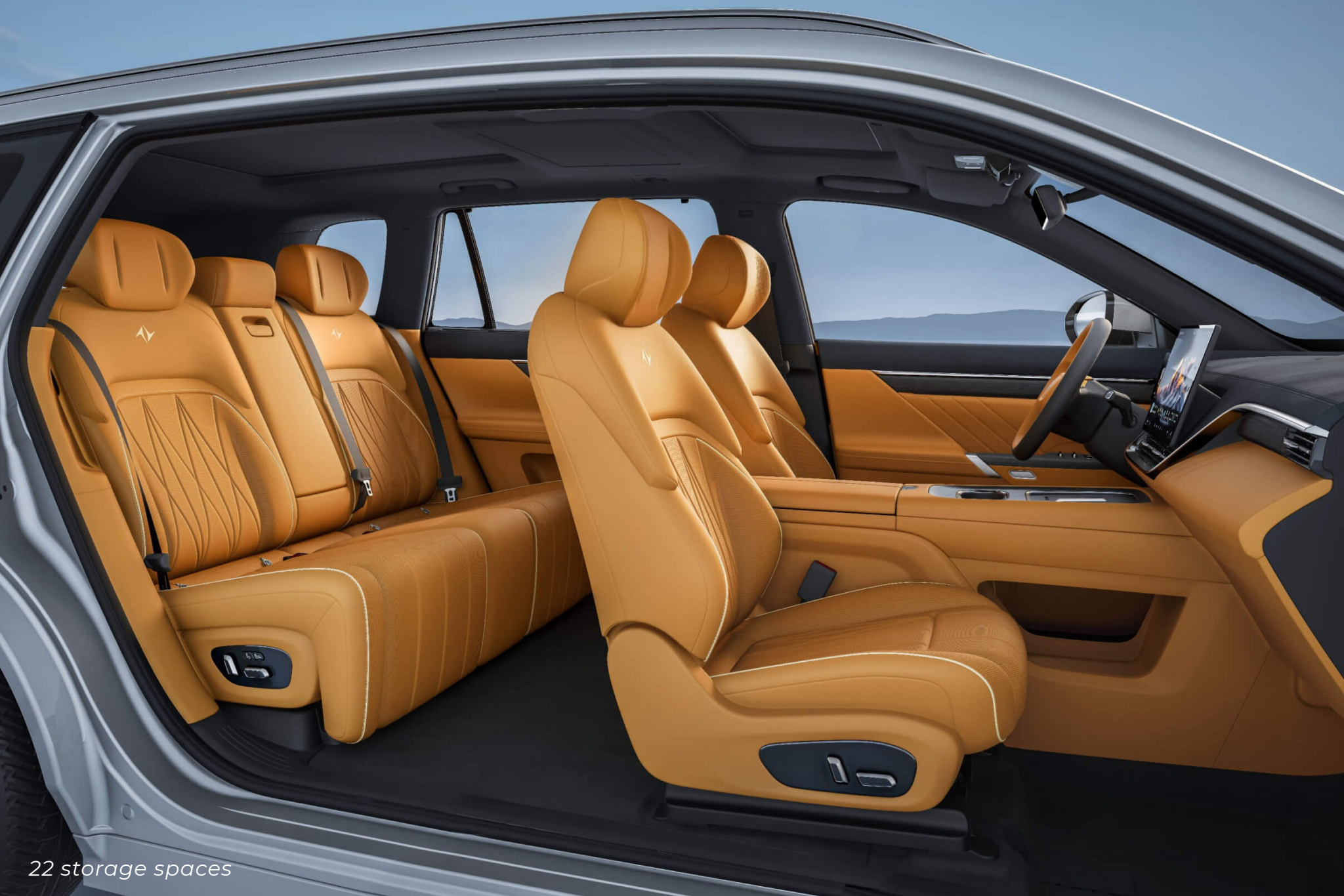
22 storage spaces