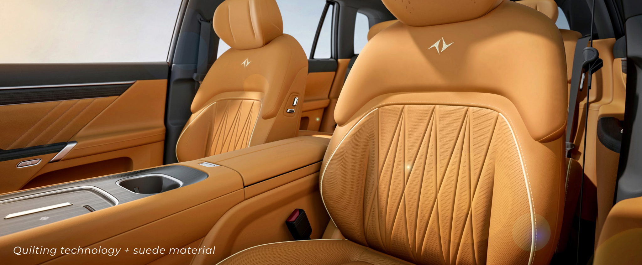
Quilting technology + suede material