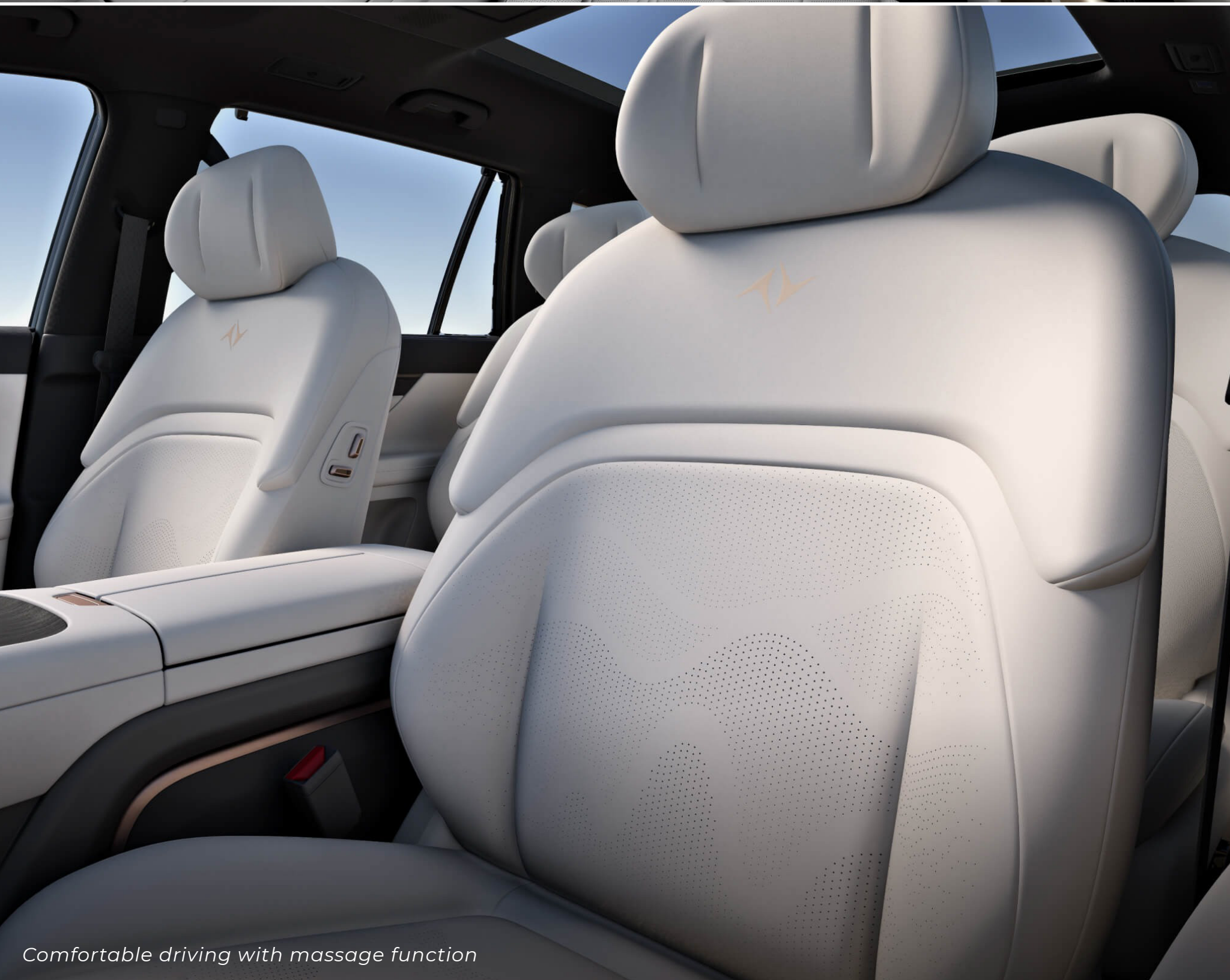
Comfortable driving with massage function