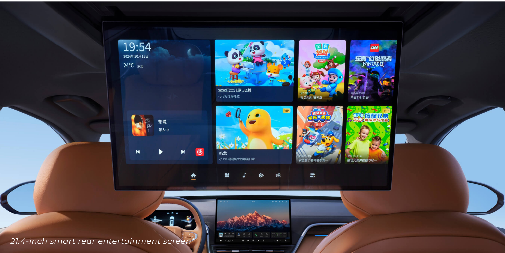
21.4-inch smart rear entertainment screen*