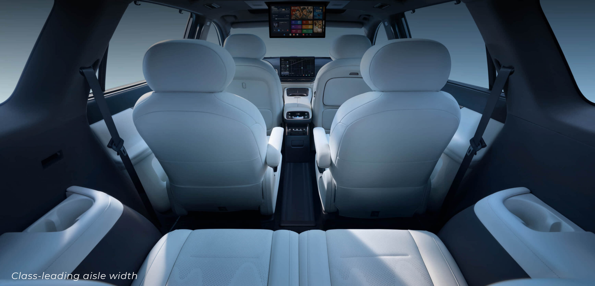
Class-leading aisle width