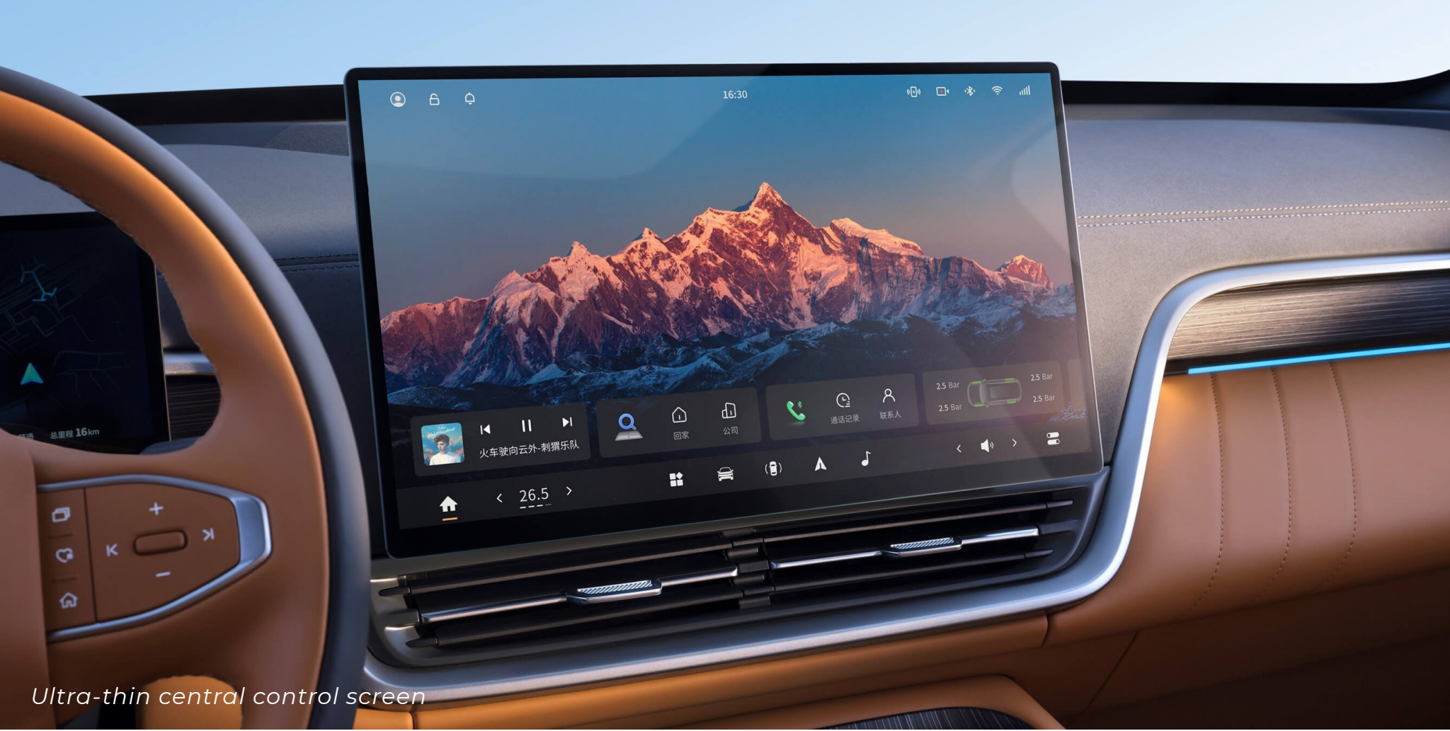
Ultra-thin central control screen