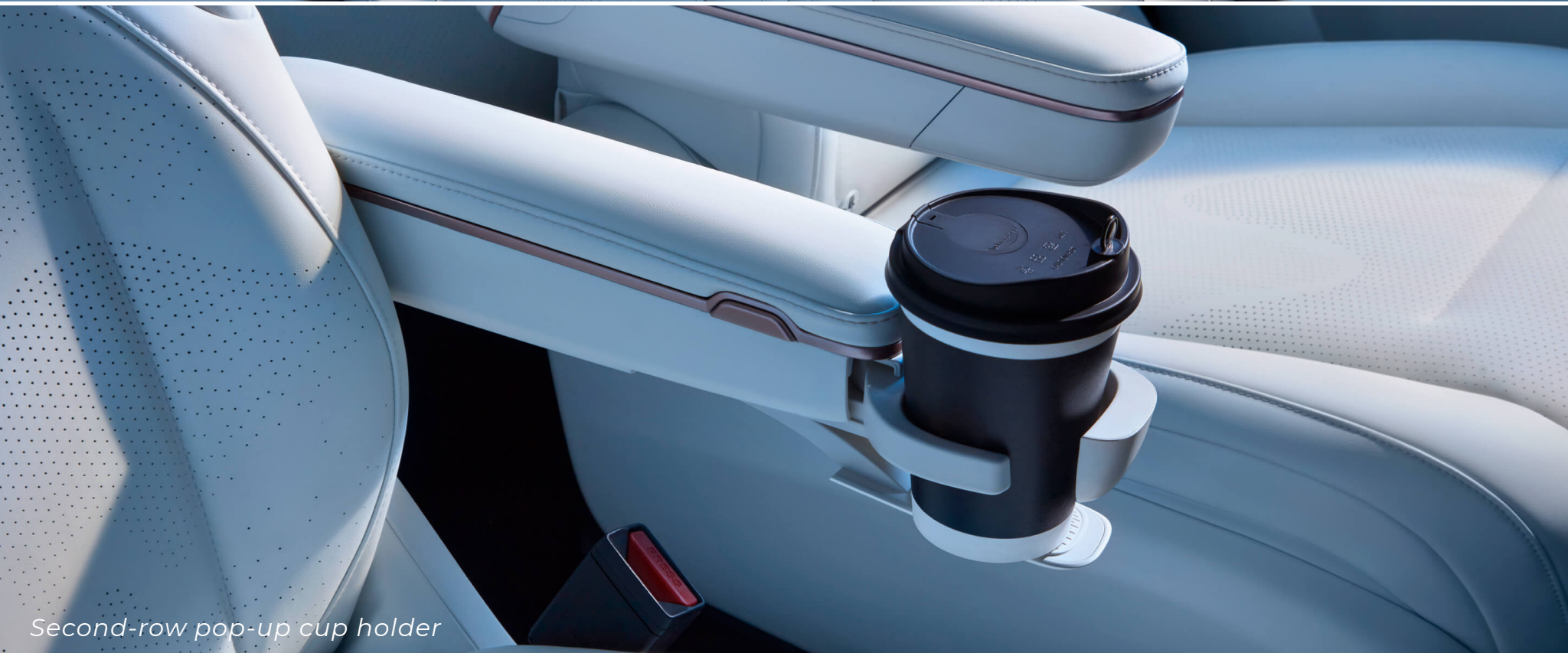
Second-row pop-up cup holder